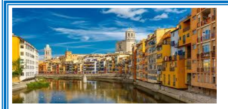
Later transfer to Girona for lunch on your own and some free time.